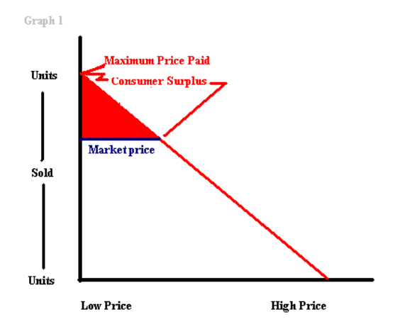
RELATIONSHIP BETWEEN ECONOMIC VALUE AND MARKET PRICE

While the value of a good or service is frequently thought of as "market price" or the "transaction price" under specific conditions (e.g. knowledgeable buyers and sellers, adequate time to market and a lack of extraordinary pressures on the buyer or seller that might force a sale), the